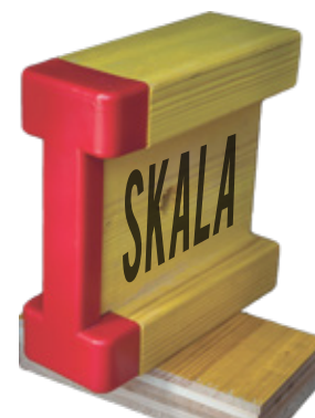
H20 Timber Beam

Custom beam lengths & beam-specific tagging are available upon request